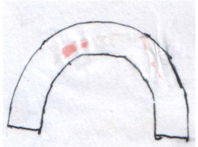
Stamp Basket Handle Template - No Seam Allowance

Make 4 – 4" units using 1,2, or 4 different fabrics for baskets