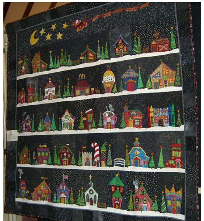
"Sanata's Village II" by Becky Magnus